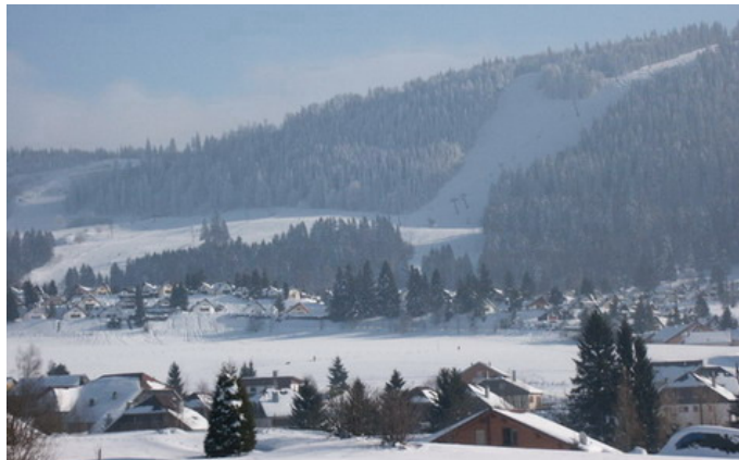
Village of Métabief (25) in Franche-Comté

There are also plenty of activities in summer time, including: mountain bike, cross country, bike trials, hiking, horse riding, summer toboggan, mountain climbing, tennis, aquatic leisure activities.