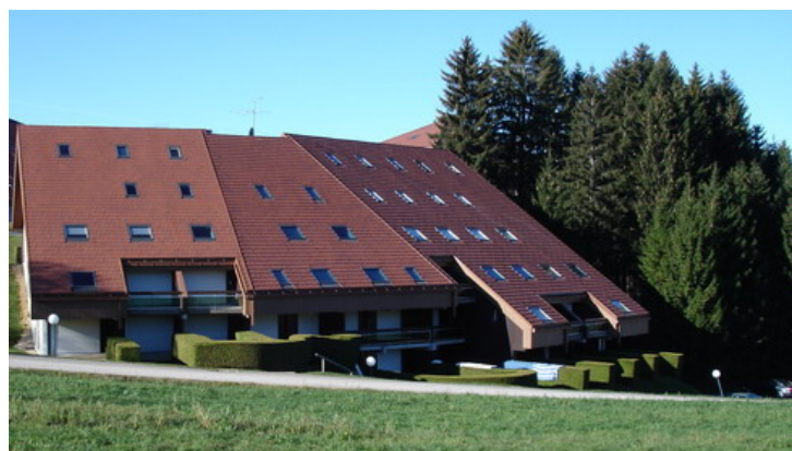
Résidence Beau Soleil in Métabief

The studio-flat is located in the village of Métabief on the ground floor of Résidence Beau Soleil, by meadows and approximately 200 metres away from the main resort.